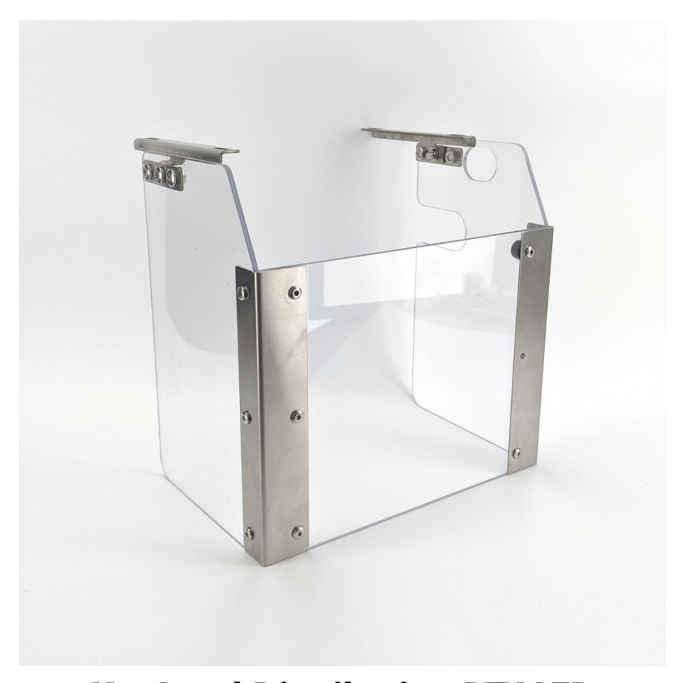
KegLand Distribution PTY LTD