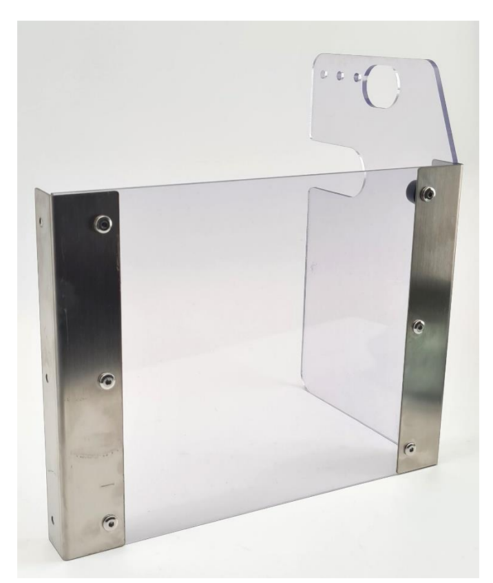
Step 4. Attach the left plate to the left bracket using the remaining 3mm socket screws and corresponding 7mm nuts. Tighten using a 7mm spanner and 3mm Allen key.

Step 3. Attach the right plate to the right corner bracket using the 3mm socket screws and corresponding 7mm nuts. The right plate is distinguished by the presence of the pre-cut hole for access to the Cannular switches. Tighten using a 7mm spanner and 3mm Allen key.