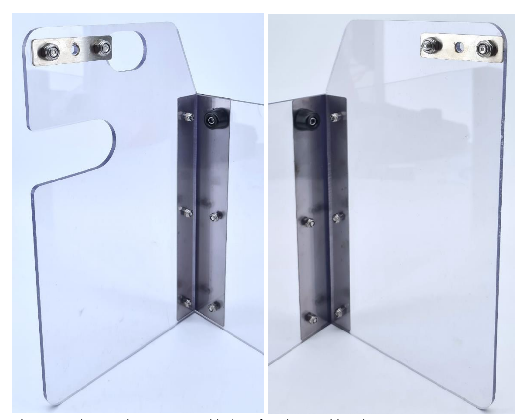
Step 6. Place a washer on the unoccupied holes of each swivel bracket